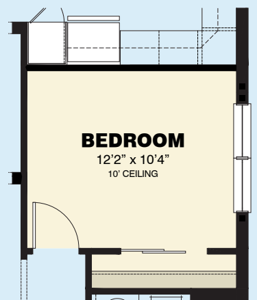
AVAILABLE BEDROOM VARIATION